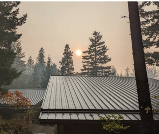
Smoky conditions at the Learning Center, October 2022

In Fall 2022, an unusually late wildfire season significantly impacted our ability to offer Mountain School. Wildfires in the North Cascades in September and October led to extreme smoke levels around Diablo Lake and at the Learning Center: the Air Quality Index was regularly over 300, which is rated as “hazardous,” and at times peaked over 800. For the first time, we had to cancel more than five weeks of Mountain School due to the smoke.